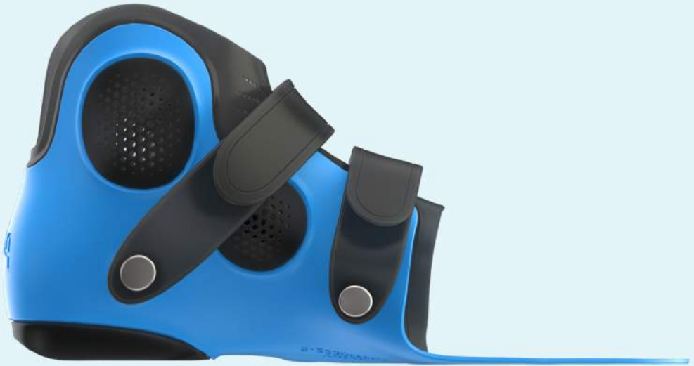
Fusion X (2-material SMO)