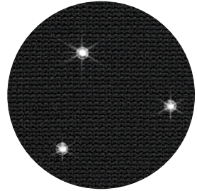
Example: Decorative gemstones on the stocking colour lava

We now offer decorative gemstones for our one-piece leg support fittings for Lastofa Forte. The shimmering stones are attached from above the ankle (measurement B) to the middle of the thigh (measurement F) on Lastofa Forte for a supplementary charge.