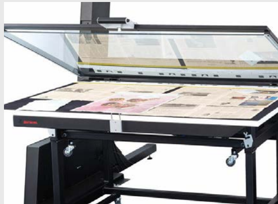
Toplight Table AT 0 with opened glass plate