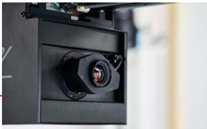
Camera system with a CMOS-based line sensor