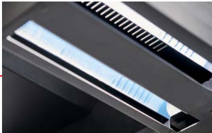
LED lighting system for reflection-free and shadow-free results