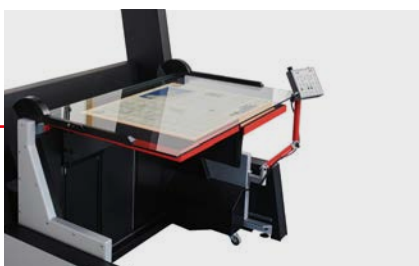
Wide range of interchangeable imaging systems